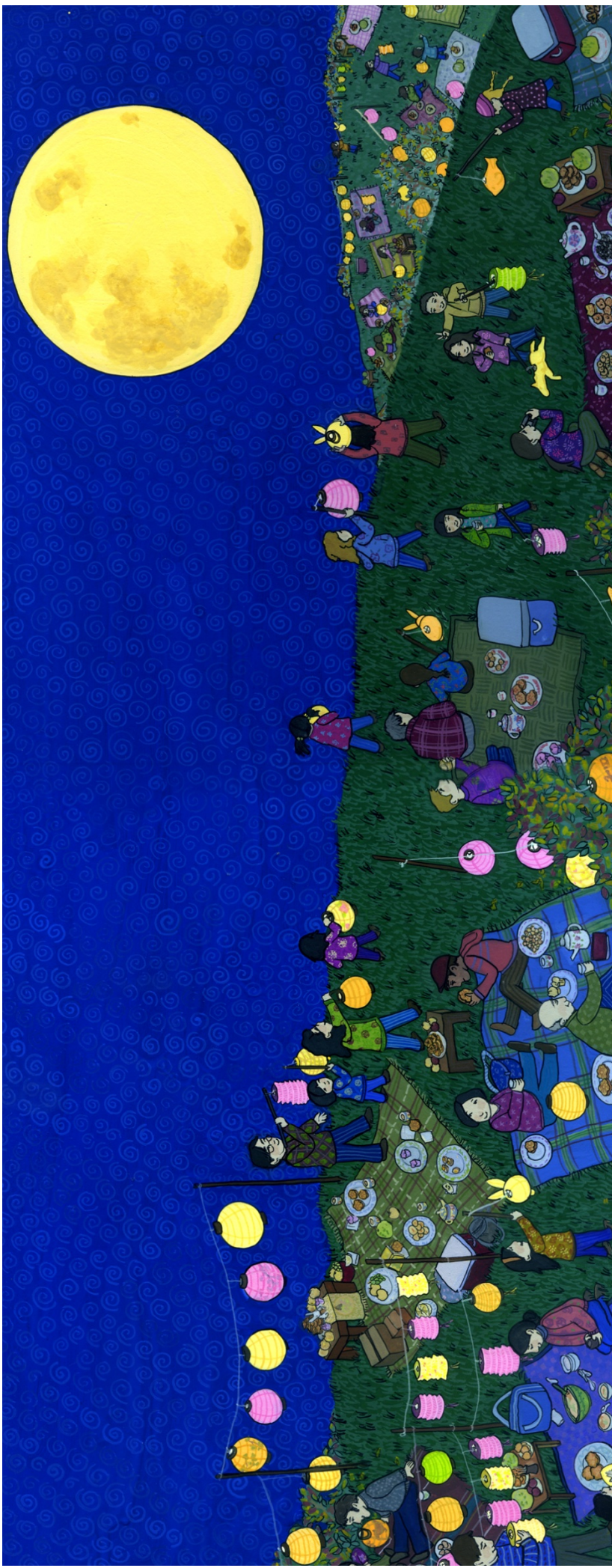
“...this night of the Mid-Autumn Moon Festival.” From Thanking the Moon © 2010, Alfred A. Knopf Written and illustrated by Grace Lin Gouache 8.75 x 20.5 inches