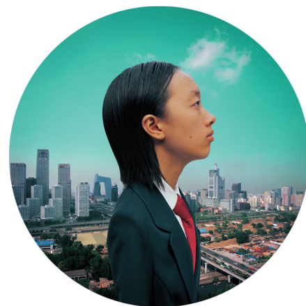
WENG FEN Future – Beijing , from the series Future , 2009

In the space below draw yourself or a friend. For the background draw in the neighborhood, city, or town where you or your friend lives.