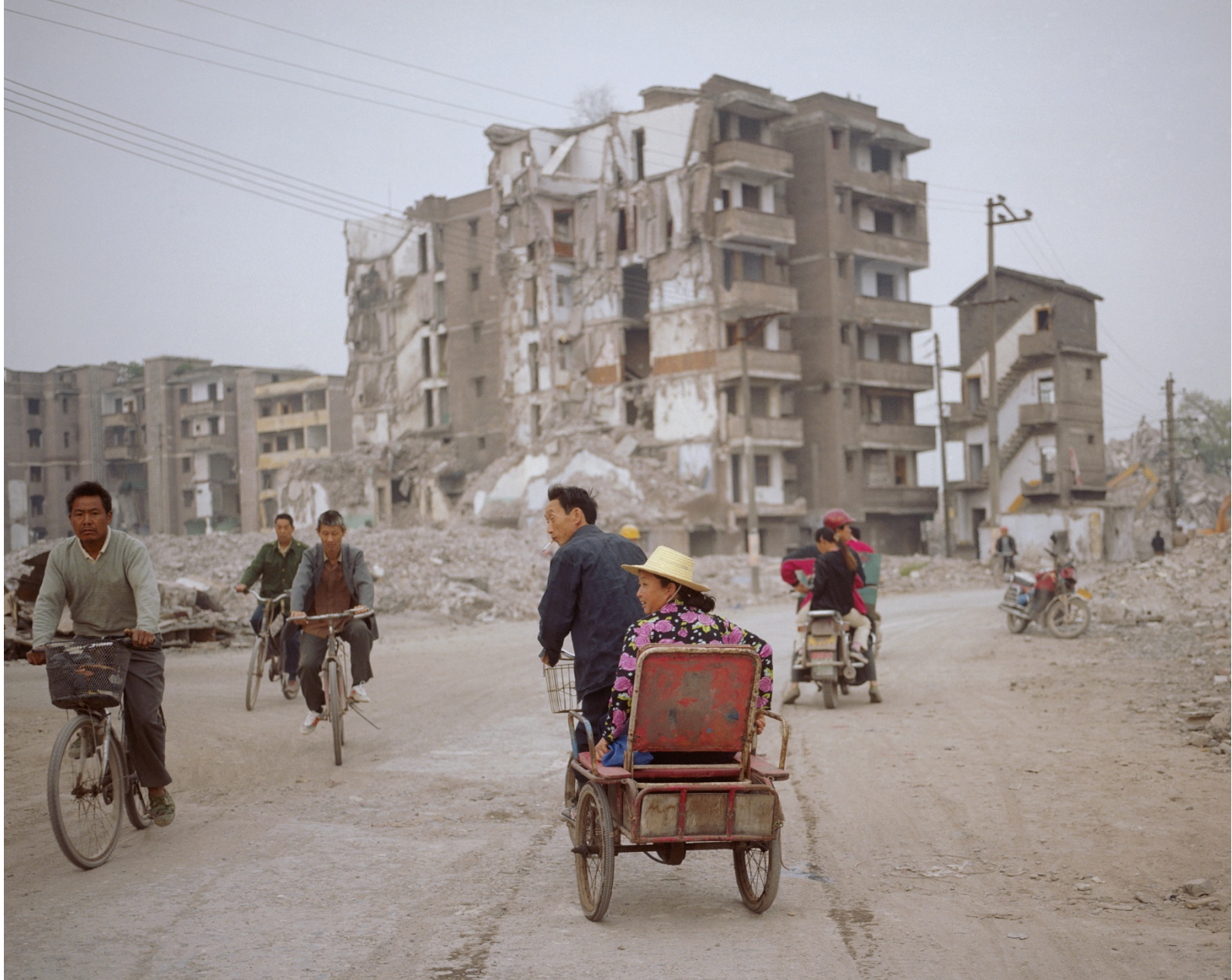
ZHANG XIAO Three Gorges No. 1 , from the “Three Gorges” series, 2008 Digital Chromogenic Print 31 ½ x 39 ½ inches