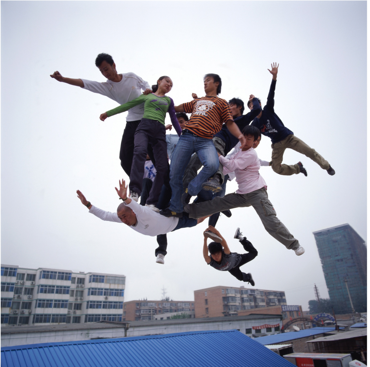
093-01. <<生活在高处6>>, "Live at the high place 6", 2008.10.09, Beijing, 176x176cm